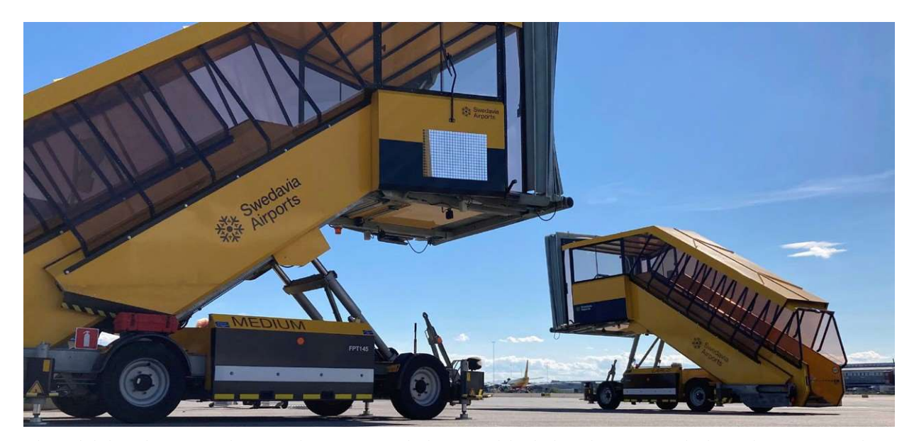
The mobile boarding stairs shown in the picture are the latest model. The boarding stairs, which are electric-powered, started to be delivered to Stockholm Arlanda Airport in 2019. A public tender process to purchase this model for our other airports is currently under way.

fossil-free biogas or green electricity. Our investments in charging infrastructure – which enables not just us but our business partners and passengers to use electric vehicles – also fall into this category.