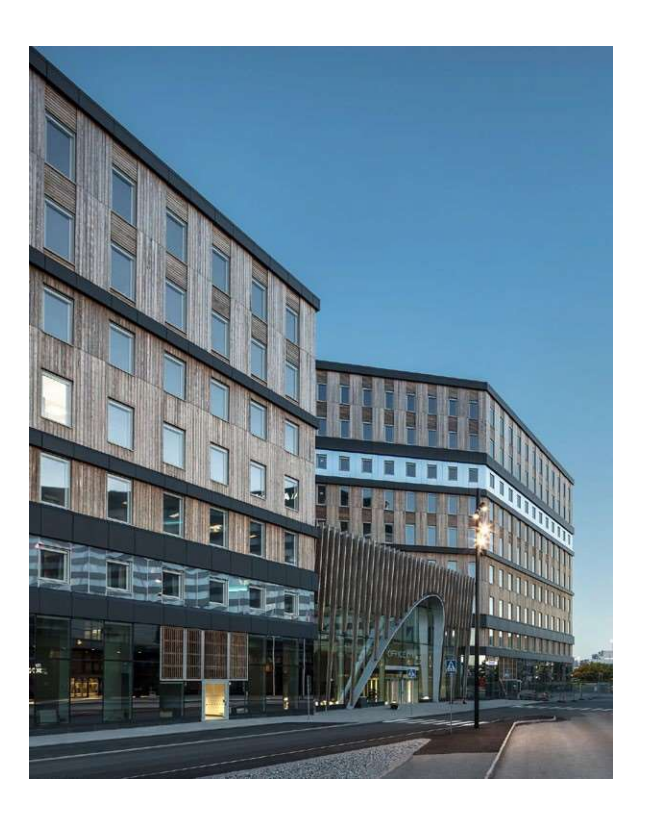
One of the projects funded by green bonds is the new BREEAM-certified Sky City Office One complex at Stockholm Arlanda.

BREEAM-SE is an important tool for Swedavia's property development operations so that the company can achieve its ambitious sustainability goals. In the autumn of 2019, Swedavia was named Property Owner of the Year with the Highest Average BREEAM-SE Rating by the Sweden Green Building Council for the recently completed Office One complex at Stockholm Arlanda and the Terminal Expansion South at Göteborg Landvetter.